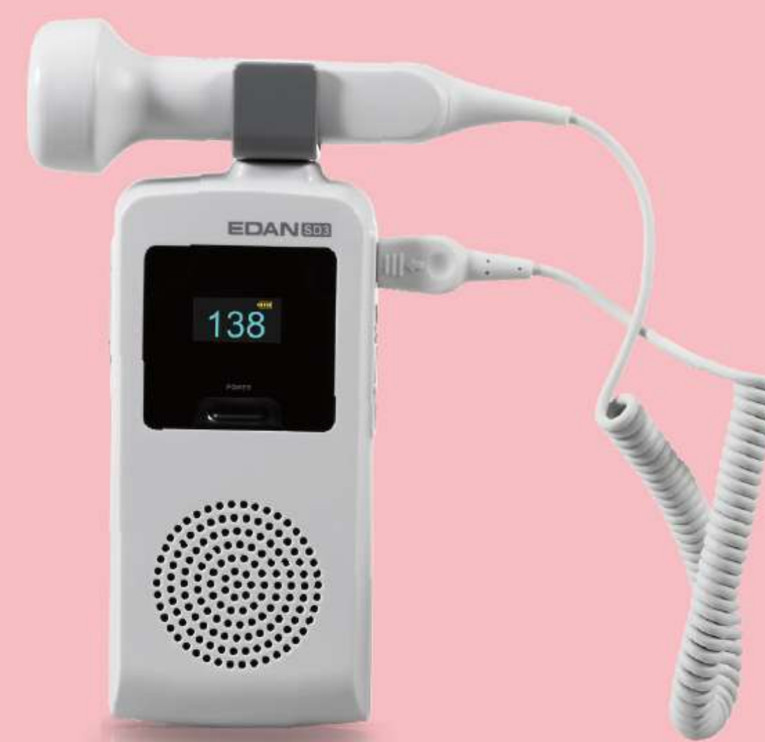
SD3 Ultrasonic Pocket Doppler